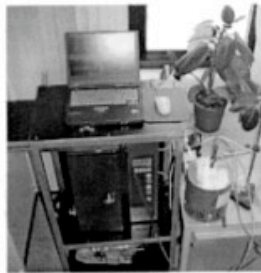
Figure 1. Test set up.

The air cleaner was placed on a desk. The concentration was measured by altering between up- and down-stream (15 mm above the outlet in the center) of the air cleaner. An ELPI (Electrical Low Pressure Impactor, Dekati FIN) was used to measure numbers and sizes of the particles.